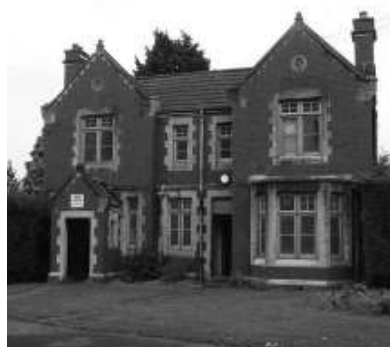
The Old Lodge in Victoria Park is being renovated after standing empty for almost 20 years.