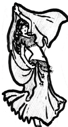
Arabic Dance with Farrah