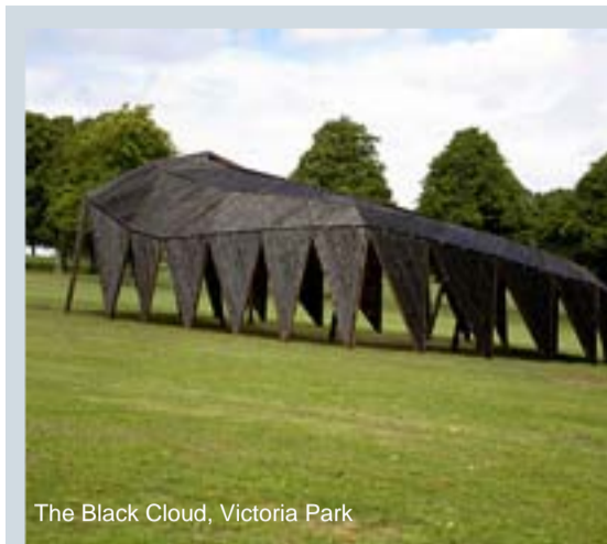
The Black Cloud, Victoria Park

So, if you are concerned about alcohol-related anti-social behaviour, telephone the police (0845 456 7000) or the City Council's Anti Social Behaviour team (0845 605 2222). You will be doing your neighbours a favour and may even help the perpetrator. Tut, tut!