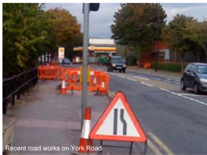
Recent road works on York Road

TRESA made enquiries about the recent road works on York Road near the Banana Bridge. We also expressed concern that the changes may increase the volume and speed of traffic along St Lukes Road, and we were hoping the new scheme would incorporate improvements for pedestrians and cyclists. We received the following response from Bristol City Council's Traffic Signals Engineer: