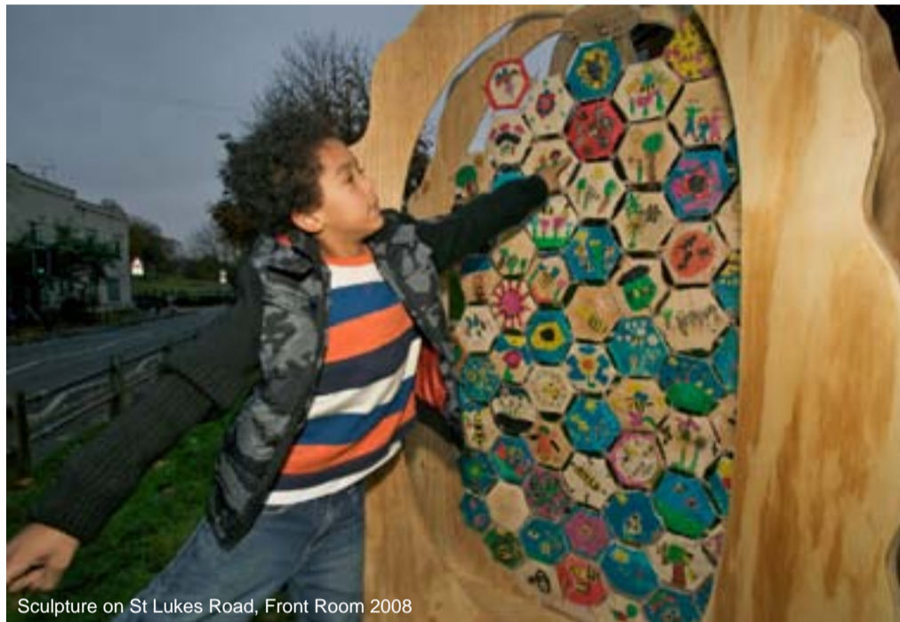
Sculpture on St Lukes Road, Front Room 2008

Established in 2001 Front Room now attracts nearly 200 artists, 60 venues and over 4000 visitors. Held over the weekend of the 20 to 22 November, Totterdown's front