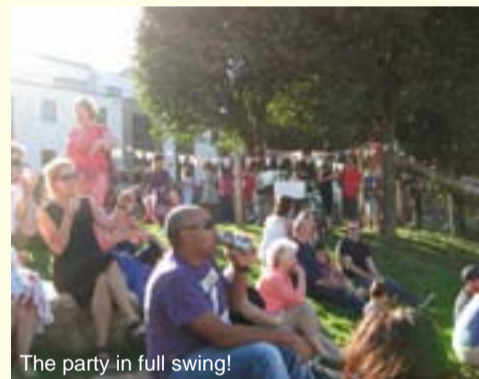
The party in full swing!

It's been a long wait, but Totterdown residents were finally able to celebrate the transformation of their local park after an £80,000 revamp. The community group TRESA - Totterdown Residents Environmental and Social Action - won the money in the Big