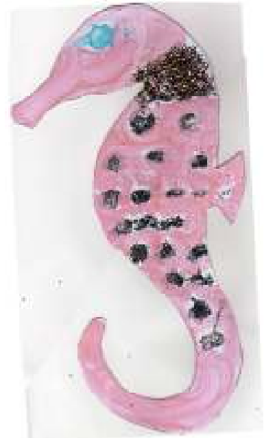
Sea horse created by Ella, age 7, at the Front Room Art Trail Craft Workshop

Is your child, or are your children, inventive, ingenious and interested in fashion? TRESA are looking to organise a fashion show for young people creating unique 'looks' from second hand clothes in 2007 to be held in Totterdown. Please get in touch by dropping us a line in the Patco letterbox, or send an email to talkofotterdown@tresa.org.uk with your name, contact details and age(s) of your children and we will contact you in the new year. Once we gauge interest we can apply for the necessary funding.